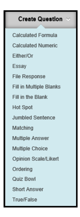
Figure 3. Question types

A major concern is whether computer-based testing meets the needs of all students equally and whether some are advantaged while others are disadvantaged by the methodology [5].